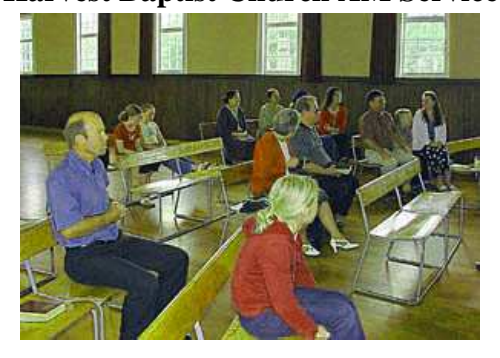
Ladies Retreat 2005