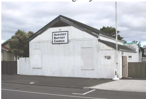
Young Men's Retreat