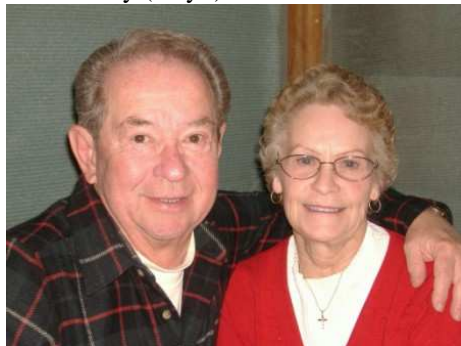
Harvest Baptist Church