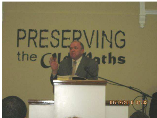
Family Camp 2010